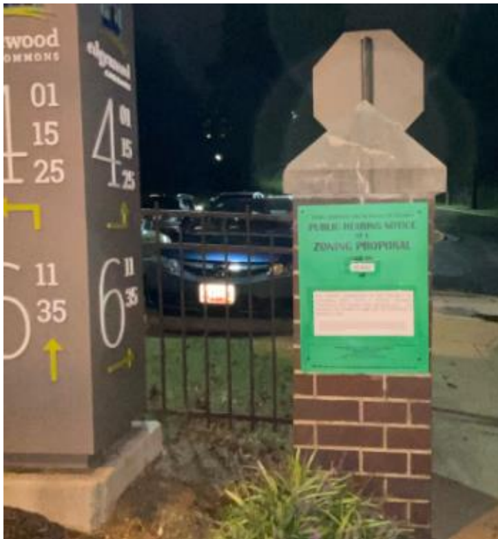
9/29/20 4 th Street NE