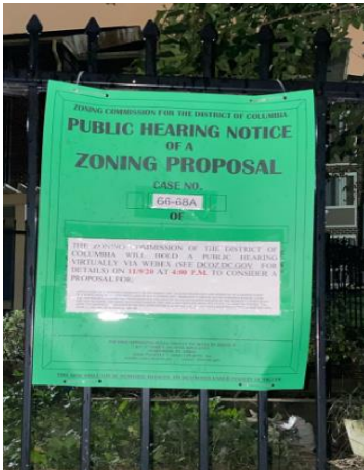
9/29/20 Edgewood Street NE #2