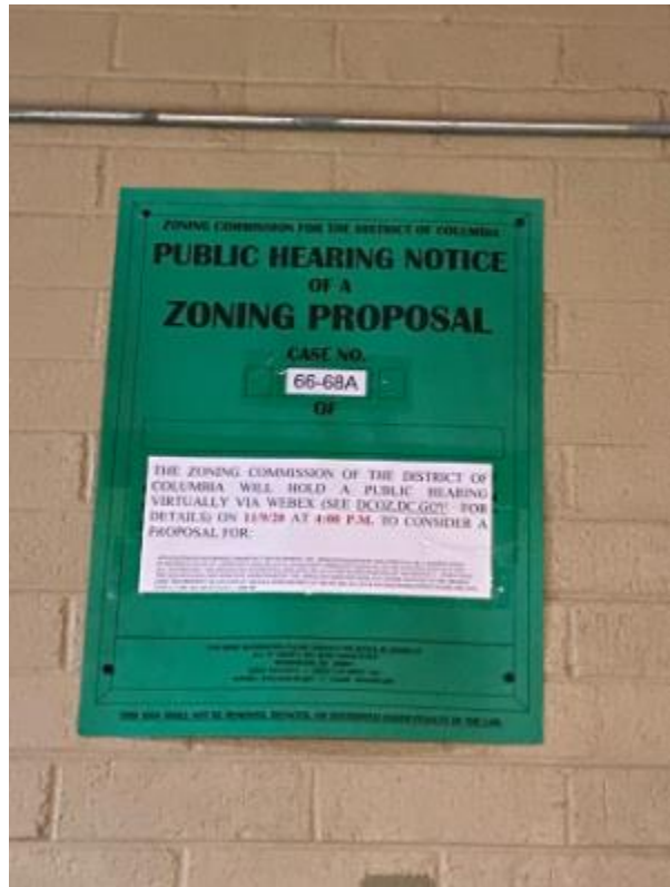
9/29/20 Edgewood St NE #4 at 7 th Street NE